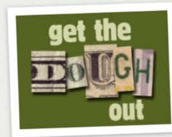
Get The Dough Out Of Politics