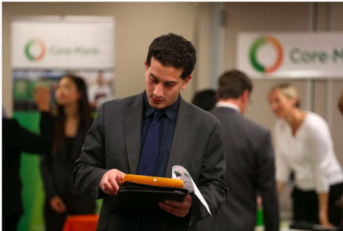
A man looking for a job in real life, not on Glassdoor.